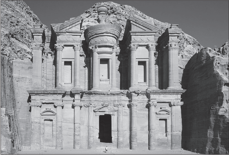
The city of Petra in Jordan, whose buildings were carved out of the cliffs, may have been visited by Paul during his desert sojourn.

to Damascus.” Here Arabia refers to an area also known as Arabia Petraea—that is, the desert kingdom whose capital was Petra and whose territory included the Sinai Peninsula to the south, modern-day Jordan, and the desert regions in the east of modern-day Lebanon and Syria. In this region there were oasis cities, but much of the kingdom was in biblical terms the “wilderness.”