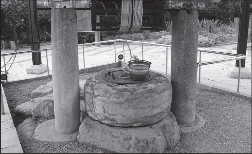
Paul's Well, Tarsus. Though Paul may never have drawn water from the well that bears his name, it is a physical reminder that Tarsus was Paul's hometown.

While living at home, Paul certainly must have continued to contemplate the meaning of the gospel. He undoubtedly grew in wisdom, which included both head and heart knowledge gained through lived experience. I've found that often the greatest wisdom-building experiences are those that come in the midst of disappointment, adversity, and waiting. Our faith often grows deeper, though we may not recognize it at the time. We don't know if Paul was experiencing a "dark night of the soul" during these ten years, but surely he wondered what had happened to the dramatic call he had heard from Ananias: "You will be [God's] witness to all the world of what you have seen and heard" (Acts 22:15).