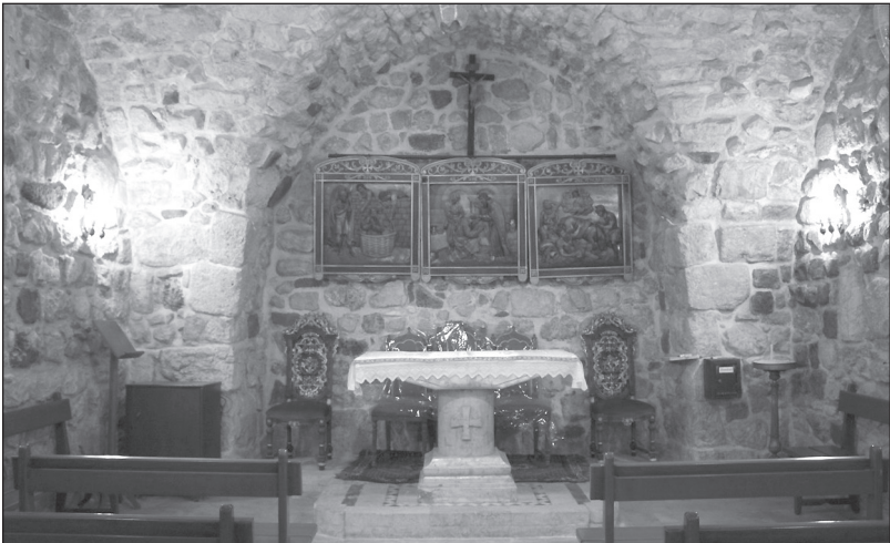
Ananias's House Chapel in Damascus. Tradition says that this chapel was built atop the home of Ananias.

Notice that Paul’s conversion was a result both of his experience of Christ and of Ananias sharing with him. This is how it often works. Most of us don’t have a Damascus Road blinding-light conversion, but we do experience Christ in some way: we feel him speaking to us, we sense his love, we feel