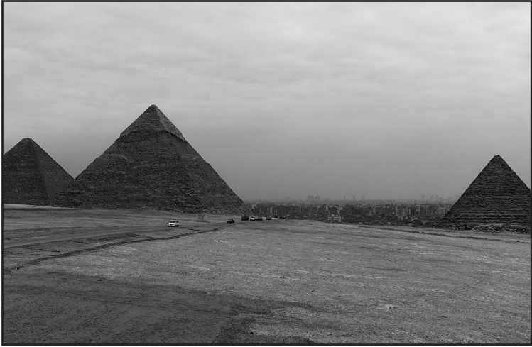
Pyramids of Giza, with the city of Giza in the background

Giza, along with the pyramid of his son Khafre and its adjacent sphinx and the pyramid of his grandson Menkaure, together make up the most prominent of the pyramids at Giza.