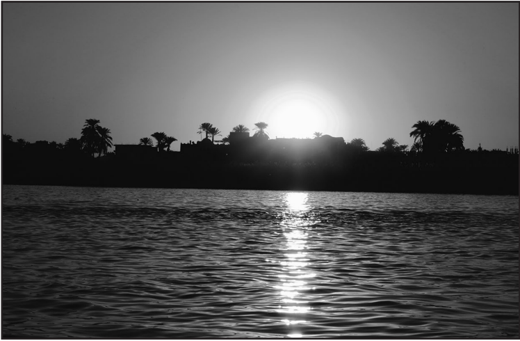
The Nile River at Luxor

And that leads us to consider Pharaoh's daughter. We don't know anything about her except that she saw the Hebrew child and, despite knowing what her father had decreed regarding Israelite boys, felt compassion and pity for the child and was moved to adopt him. How easy it would have been for her to have left the child there in the basket on the banks of the Nile, perhaps fearing her father or believing that surely someone else would save him. But instead her compassion led her to lift the child from the water, risk her father's wrath, and take him home, adopting him as her own child.