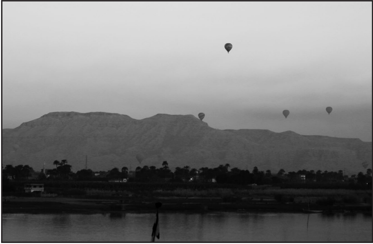
Hot air balloons at sunrise over the Valley of the Kings

photos of some of these locations, and in the video designed to accompany this book I will take you to these locations.